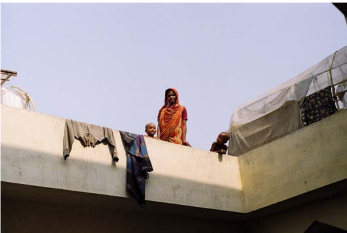
Whole families live on the roof of the Union Parishad offices.