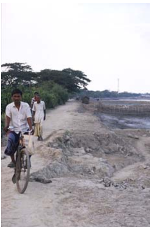
An embankment that was damaged by Cyclone Aila. It doubles as a road and a base for additional constructions.

The Bangladesh Water Development Board (BWDB) is charged with maintaining the embankments. However, as stated in the BCCSAP: "Many of them are in poor shape due to lack of proper maintenance. Local people also sometimes damage embankments by cutting through them to drain water from the land into the rivers. Although these gaps are filled in again, these points remain vulnerable to breaches. In many places the [related] structures, such as sluices and regulators no longer function properly." Sometimes people also cut down the stabilising trees from the banks. Given this, it is very important to rehabilitate existing river flood embankments so that they are fully functional and able to provide the level of security for which they were constructed. Responsibility for these infrastructural works lies with the Ministry of Water Resources – it is too large-scale for most NGOs to engage in.