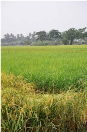
These fields in Satkhira are protected by an embankment three kilometres away. After Cyclone Aila the area was inundated and one crop was lost, but the farmers have managed to get back on track with the next crop.

Another sign of how polders make it possible to ignore the dangers of flooding is farmers' choice of rice varieties. Farmers typically choose to grow short-stem, high yielding varieties of paddy because of the security provided by the embankment and associated drainage systems 45 - a practice where the embankments and high-yielding varieties are mutually dependent. Long-stem local rice, suitable for fields with flood risk, yields less and is not suited for being grown on poldered land. Growing short-stem rice, again, requires polders in place. According to Dr Datta this is a systemic error at the beginning of a process that can't be reversed without undoing the entire initiative. "And there are hundreds of errors like this."