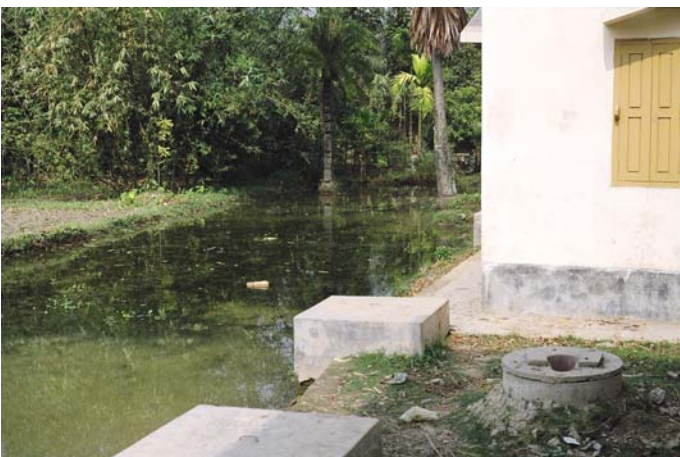
The waterlogged area behind the Union Parishad office – stagnant water next to the latrine.