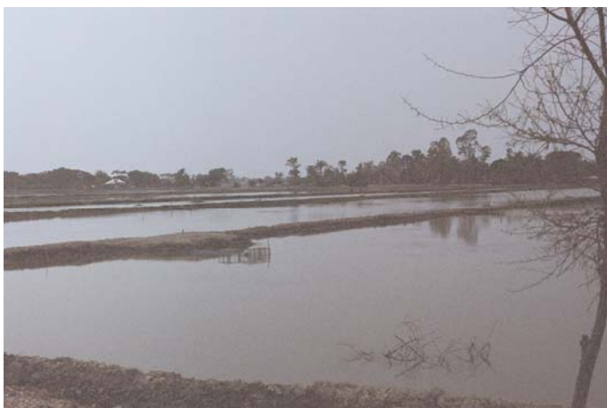
Shrimp farms, Satkhira district.

Shrimp is a lucrative export earner for Bangladesh but it has serious social and environmental drawbacks: the export income from shrimp is not reinvested for the benefit of the areas where shrimp is farmed 47 . Two main types of shrimp are grown in southwest Bangladesh: bagda and golda. Bagda shrimp need salt water ponds whereas golda can be farmed in ponds with lower salinity, e.g. in rice fields in rotation with rice, vegetables and fish. Bagda shrimp are larger, more popular and more valuable.