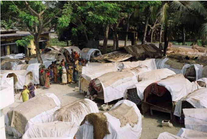
Displaced people camping at the Union Parishad office and subsisting off cash for work – their land had been inundated for four months.

citizens do not wish to share spaces with them 59 . This example shows how prejudice is stronger than need. Climate change management plans need to take into account the prejudices and marginalisation between the different rural populations that need support. Dalit NGOs are, similarly, excluded from networks or cooperation with NGOs that 'work with everybody' – in practice this often means 'everybody except Dalit' 60 .