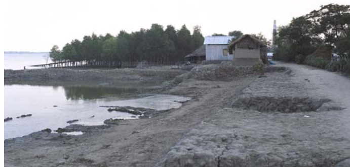
The same embankment. Note that the houses constructed on the embankment have been raised another metre on top of the embankment.

We were conducting interviews six months after Cyclone Aila, and the damage it wrought on embankments, the flooded farmlands and the displaced people were still a very fresh and urgent issue. The Bangladeshi Army had been repairing embankments and had to solicit help from locals