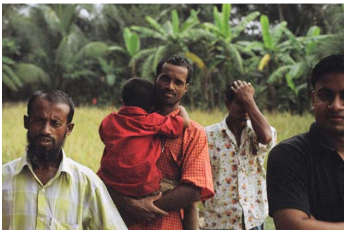
Local farmers, Botiagata village, Khulna. The area was covered in shrimp farms under the protection of a local strongman/ businessman in the mid-1990s, who was ousted with the help of the 1996 Awami League government. The villagers have managed to rehabilitate their rice fields from the shrimp ponds.